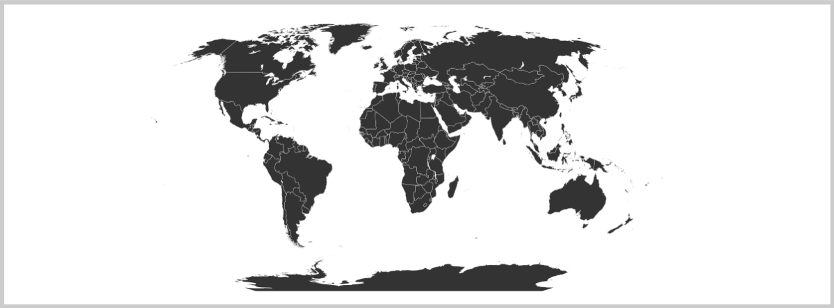
Large-scale world map print: dimensions 4x2m.